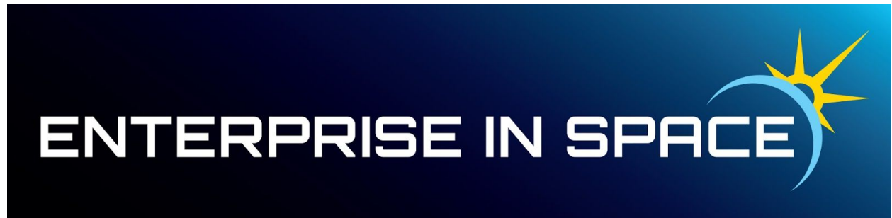
The EIS Banner